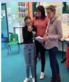
Year 11 organised a coffee and cake sale and lunch time karaoke fun